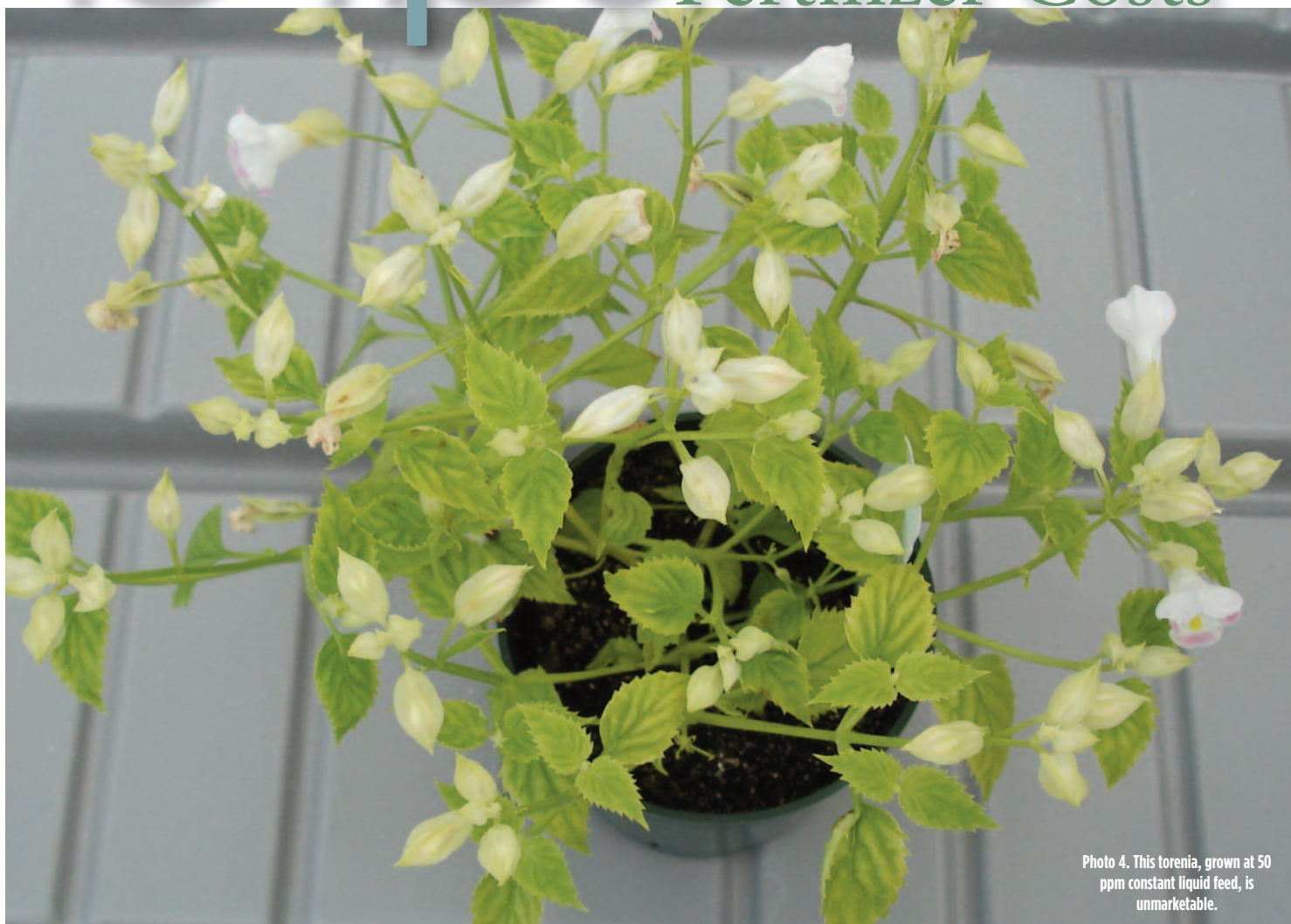
Photo 4. This torenia, grown at 50 ppm constant liquid feed, is unmarketable.