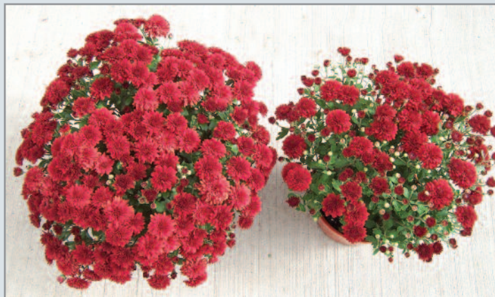
Photo 3. Chrysanthemum 'Helen' grown using constant liquid feed (left) was significantly larger than plants grown using only controlled release fertilizer (right).

By incorporating these tips you'll be well on your way to getting the most bang for your fertilizer buck! GT