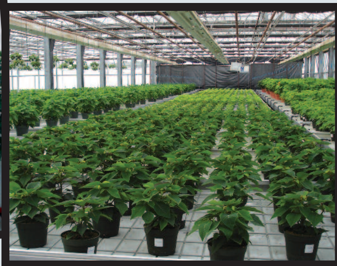
Photo 2. Sub-irrigated poinsettias.