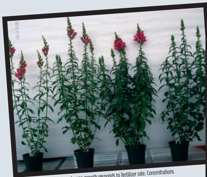
Photo 1. Snapdragon growth responds to fertilizer rate. Concentrations were (left to right) 50, 100, 200 and 350 ppm N.